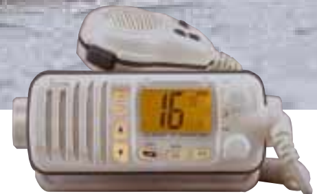
White Color Version