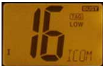
The photo shows actual display size.

A large LCD is incorporated into the design allowing easy viewing of the large channel display and the scrolling 10-character channel name system—even in direct sunlight, or when water has splashed on the screen. In addition, the 4-step amber backlighting for the LCD and switch illumination, allows the set to be seen in low-light conditions.